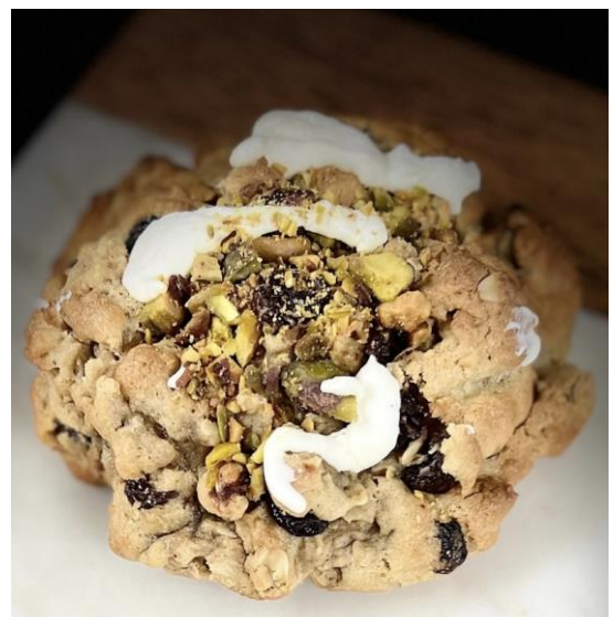
Oatmeal raisin Pistachio