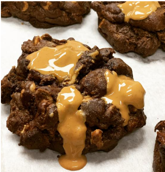
Chocolate Peanut Butter

You can find cookie everywhere but nowhere like our Chubby Cookie. The size of your palm cookie with premium quality ingredients. We add details to each flavor so you get more and more. Each cookie is hand crafted with love. Crispy outside OOZY and GOOEY inside. They are so special. The chubby cookie has already sit in someone's heart.