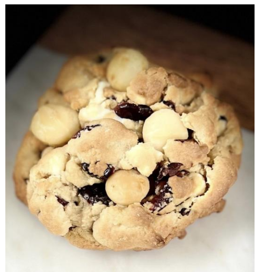
White chocolate chip Macadamia